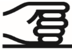
To Help (1)