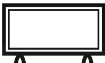
Television/ TV (2)

Makaton Sign of the week has been: Television/TV