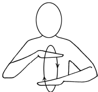
Patient/ Calm (to be)

Makaton sign of the week has been; patient/calm. Full details can be found on Makaton.org website.